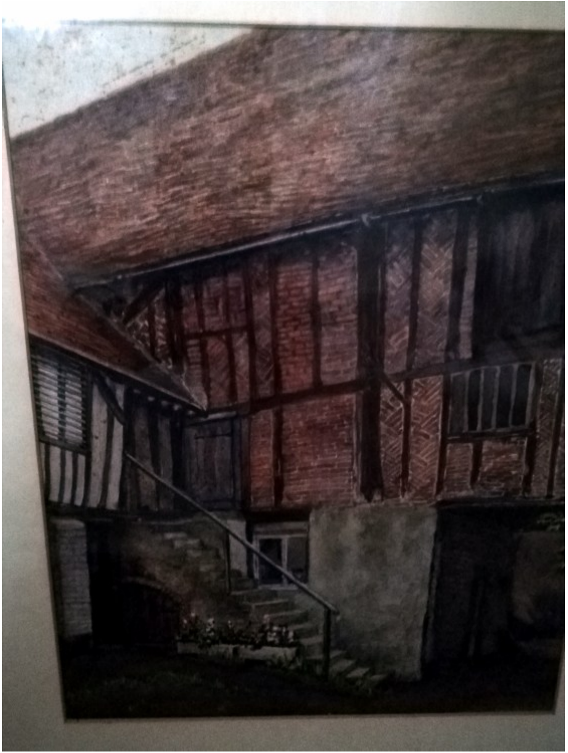
■ Isaac Lords Ipswich Docks