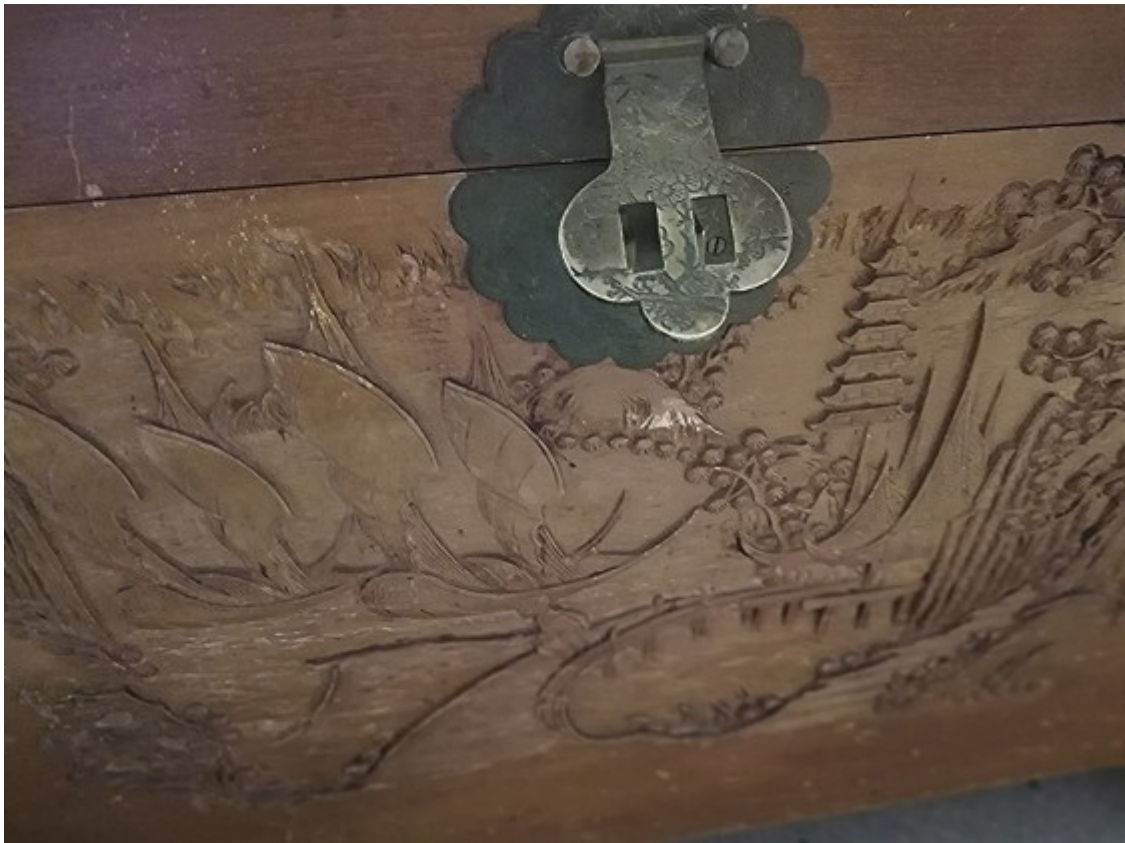
Lot 294: An oriental camphor wood blanket box – with key. Again above my budget, estimate £50-£80. But can I pause for a