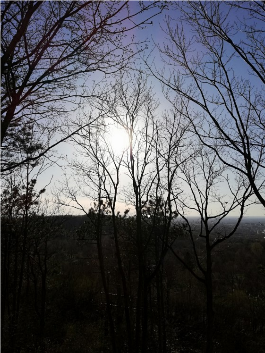
Warming the trees

Thank you, Montreal, for welcoming me and allowing me to call you home for a few days. I appreciated the challenge of Mount Royal, I learned about your culture and some of your history through discovering your art, through meeting beautiful people and tasting your food. For now I must say goodbye, but know