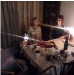
Family fun Nov. 5th 2015

In our health and safety conscious modern times bonfires are rare, and families tend to attend community events providing firework displays. Whilst understanding the benefit of these, I cannot let go of that joy of holding a firework in your hand and letting its magic delight for a second or two. Sparklers ready, here I go.